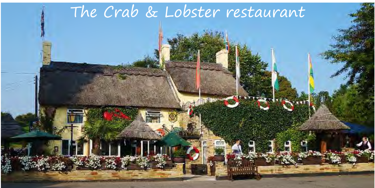
The Crab & Lobster restaurant

Continue along the road and pass under the flyover. After a short left-hand bend take the road off to the right. It is signposted Sessay and Dalton Industrial Estate, but after 500yds turn left to Dalton. At Dalton pass Springfield garage on the left and after 180yds turn left towards Sowerby, Thirsk 5 miles. As we arrive back in Thirsk you will recognise that we have completed a full circle. Continue back along Sowerby Front Street to the mini-roundabout and then right to Thirsk Market Place.