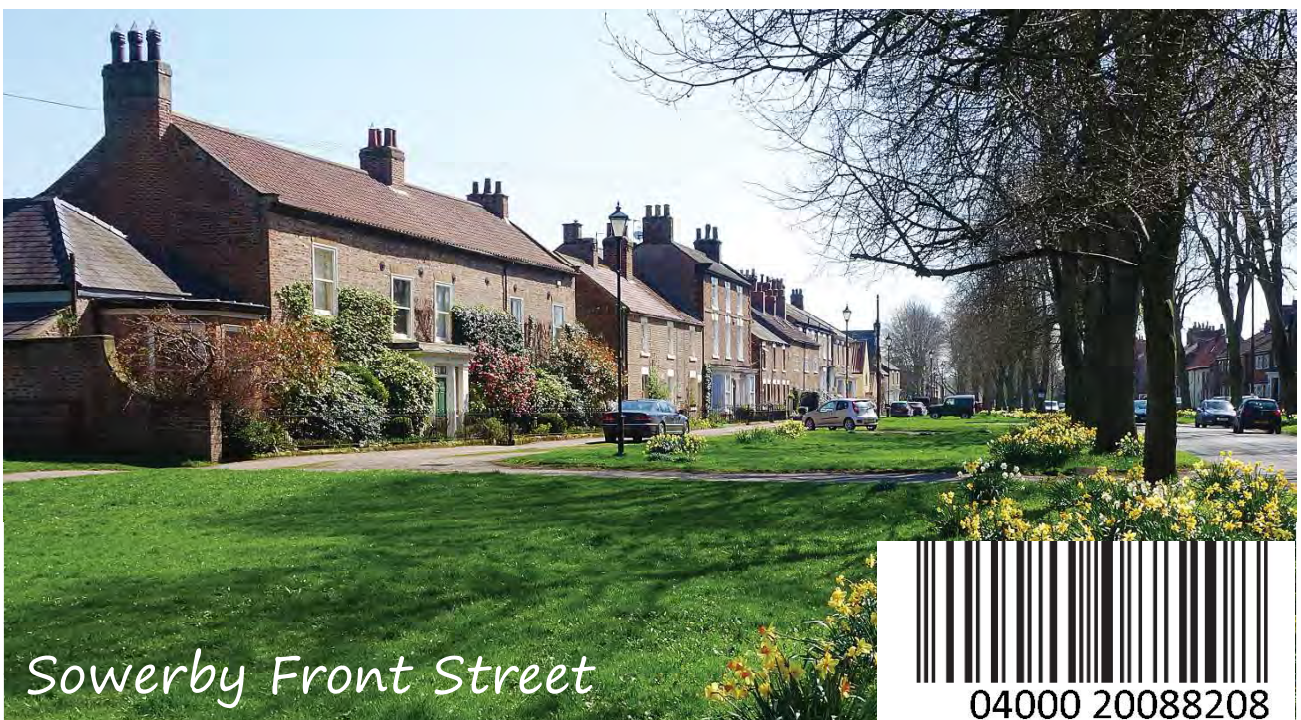
Sowerby Front Street

Turn left signed Coxwold, Helmsley, Caravan route. We now have a 5 mile