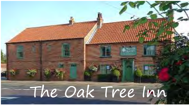
The Oak Tree Inn

Brafferton & Helperby are our next stop. As you enter the village note the Oak Tree Inn on the left. The village of Brafferton is ahead and this is conjoined with Helperby.