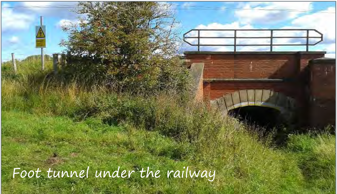
Foot tunnel under the railway

have not been able to ascertain why it should be here. Continue along the field edge till you pass four large trees on your right – the last is an oak tree – and you reach a crossroads of footpaths where you will turn right to follow the direction of the yellow arrow on the direction post (in the hedge). But first it is worth turning back to see the distant views (on a clear day) of the Dales behind you and the Hambleton Hills ahead of you.