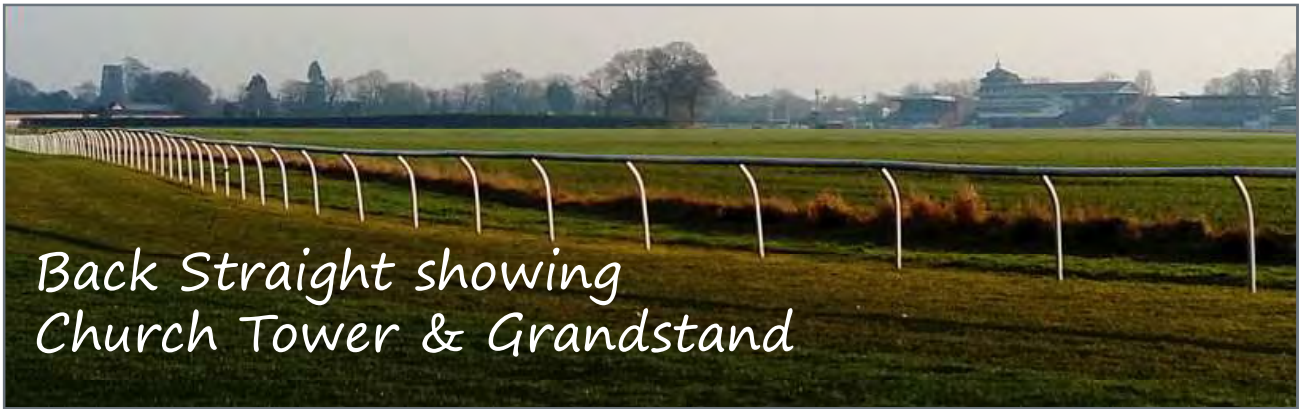
Back Straight showing Church Tower & Grandstand

Turn right, and after 50 metres turn right into the Treske Furniture factory access road. Keep to the right and go through the pedestrian gate next to the aluminium railway maintenance vehicle gate onto a tarmac lane alongside the railway track-side fence. This continues for 200 metres becoming a rougher unmetalled track for 100 metres alongside the gardens on the left of a terrace of older houses. After the railway maintenance vehicle access gate on the right, the track narrows to single file and soon bends around to the left between some silver birch trees into a field. The path splits – take the right